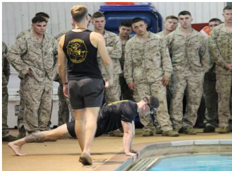
Student Officers conduct WSA training to prep for IOC.