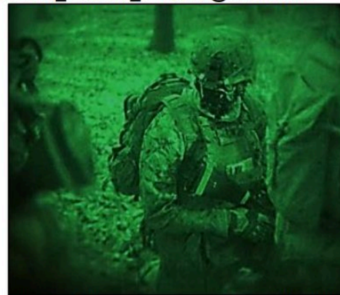
Student Officers conduct a combat patrol at PEX.