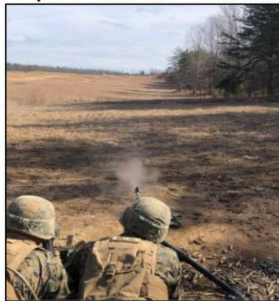
Student Officers suppress enemy positions at R-11.

The Warning Order is designed to help you prepare for The Basic School (TBS) and set conditions for success as a Marine Officer. This month's issue includes information on heat injury mitigation and actions you can take as an inbound student officer prior to arriving at the Basic Officer Course (BOC). During your preparation time prior to reporting to The Basic School, visit the following website and create a MarineNet account: www.marinenet.usmc.mil . As mentioned in our "Contact Us" section, if you have any questions send an email to: TBS_Student_Liaison_Officers@usmc.mil .