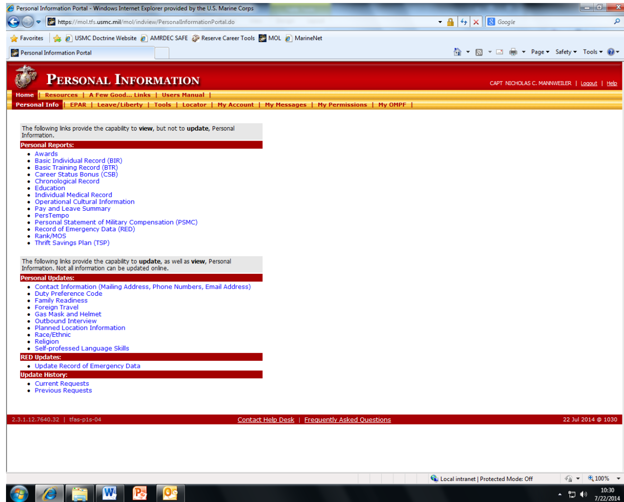
Sample Screen of Marine On Line Personal Info Tab