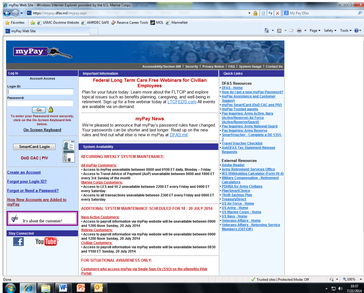
Sample myPay Log-in Screen