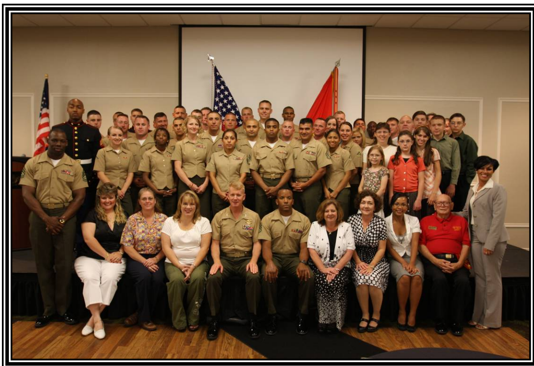
MATSG-21 2010 Volunteers