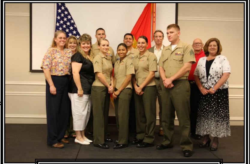
MATSG-21 Young Marines Volunteers