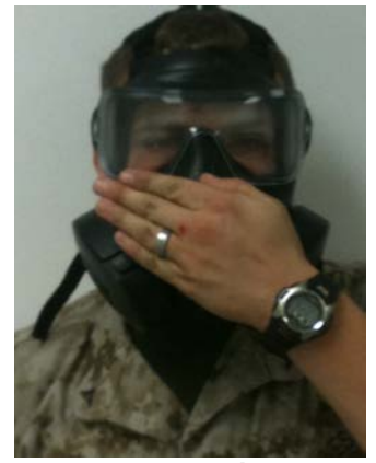
Figure 6. Clearing the Mask

(10) Blow out hard to ensure that any contaminated air is forced out around the edges of the mask assembly.