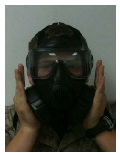
Figure 5. Negative Pressure Test

(3) Clear your face-piece again and recheck for leaks.