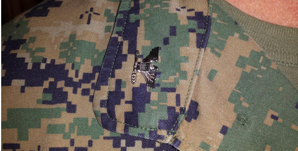
Figure 3. Captain Rank Insignia

(c) Breast insignia - will be centered on the pocket on a horizontal (parallel to the ground) line, even with the highest point of the service tape, a second device will be worn 1/8 inch above the 1 st device.