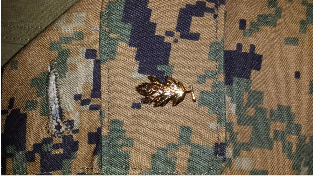
Figure 1. Medical Service Corps Insignia

(b) The rank insignia - is worn on the right side of the collar centered 1 inch from bottom edge and parallel to the deck.